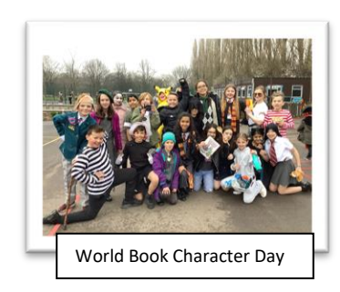
St John's C.E. Primary School