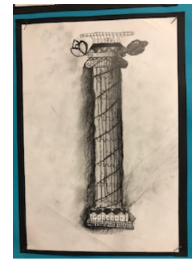
Sketching Year 5 & 6