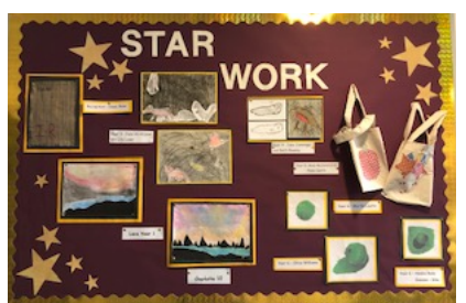
Star work from STEAM Week