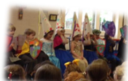
Reception Class Assembly