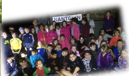
Residential to Nantglyn